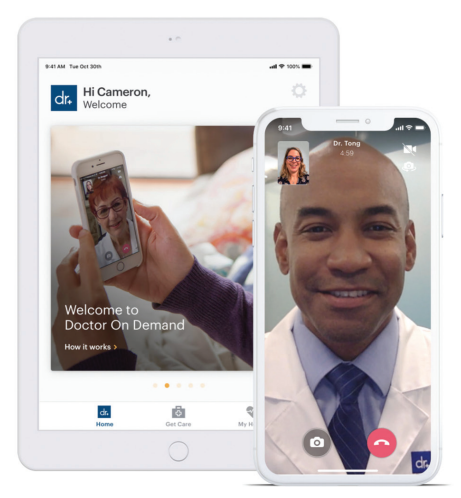
These images are of actors who portray a dramatization of a Doctor On Demand virtual visit.

Download the free Doctor On Demand app or create an account at doctorondemand.com.